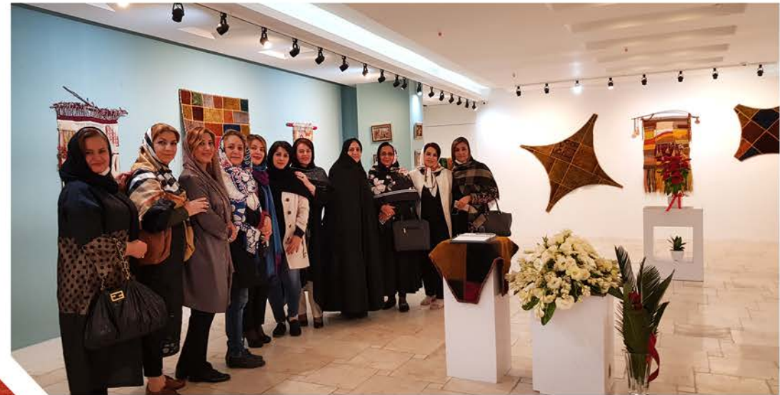
"Iranian Hand Woven Solo Exhibition" October 2020 Held at: Ferdows Institute of Higher Education Gallery, Mashhad, Razavi Khorasan, Iran